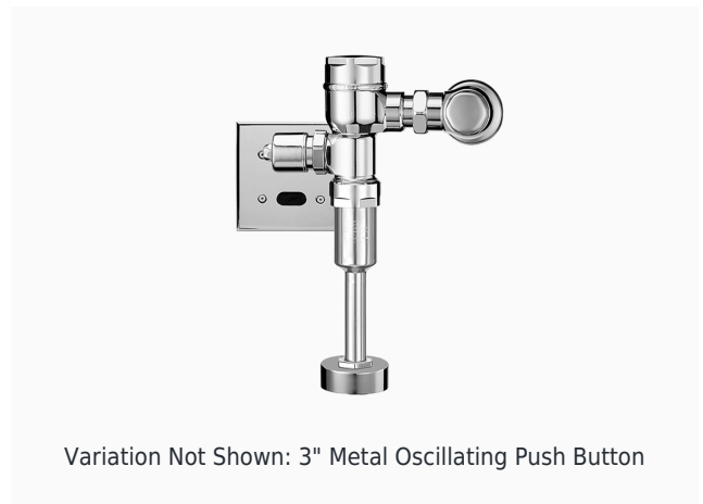
Variation Not Shown: 3" Metal Oscillating Push Button